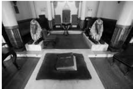
Freemason's Hall, Dublin